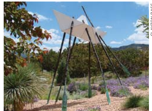
Light Boat , by Kevin Box