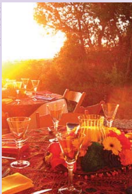
Join us September 13th for a Harvest Dinner